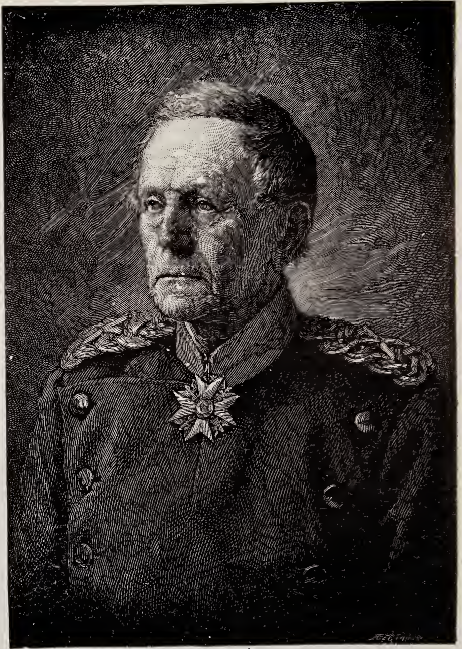
GENERAL VON MOLTKE